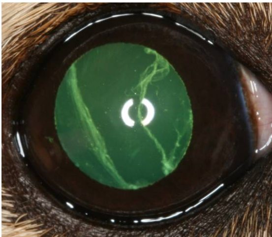
Vitreous prolapse – a very early sign