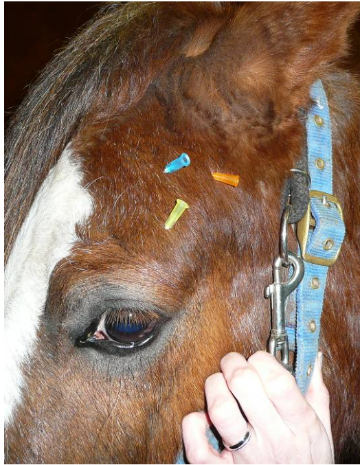
Figure 1: Three sites where the auriculopalpebral nerve may be blocked.

A sensory nerve block is performed by anaesthetising the supraorbital nerve, the branch of the Trigeminal nerve (CNV) which is sensory to the central upper eyelid. The nerve exits from the supraorbital foramen within the frontal bone, and it is blocked by the subcutaneous injection of local anaesthetic, as used for the auriculopalpebral nerve block. A combination of these blocks will reduce pain and stop spasm of the orbicularis oculi muscle, allowing the upper eyelid to be lifted and a more thorough examination to be carried out. The eyelids will be flaccid for inserting the ocular lavage system. A local nerve block is achieved by instilling 2-3ml local anaesthetic near the medial canthus, directed medially towards the zygomatic sensory nerve and dorsally towards the lacrimal sensory nerve (Figures 2 and 3). Topical anaesthesia is instilled into the conjunctival sac.