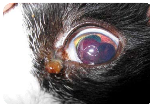
Figure 6: Blood clot in anterior chamber (hyphaema), with iris synechiae from one to three o'clock, caused by hypertension.

Vision may be assessed with a combination of the menace response, dazzle reflex, tracking response to cotton balls, placing reflexes, and behaviour in an unfamiliar environment. Note a non-visual eye may have a normal PLR: for example, in the presence of a cataract. Similarly, a visual eye may have an absent PLR: for example, with paralysis of the oculomotor nerve.