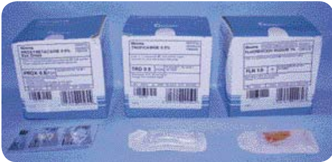
Figure 3: Commonly used topical drops for diagnostics.

condensing lens is very useful and will be discussed later.