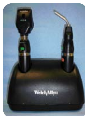
Figure 2: Direct ophthalmoscope and Finhoff transilluminator.

Firstly, it is important to consider the equipment available. The animal should be examined in a room that is capable of being darkened. It is helpful if there is an assistant to restrain the animal, keeping the head still, without putting pressure on the animal's neck. A focal light source is required. This can be provided by a simple pen-torch. Other sources may be a Finhoff transilluminator, a direct ophthalmoscope, or an otoscope (Figure 2). Some form of magnification is required. Examples include a direct ophthalmoscope, head-mounted loupes, an indirect ophthalmoscope or a slit-lamp bio-microscope. A hand-held