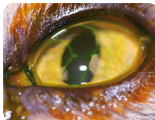
Figure 12: Fluorescein uptake in the case of dendritic corneal ulceration caused by FHV-1 infection.