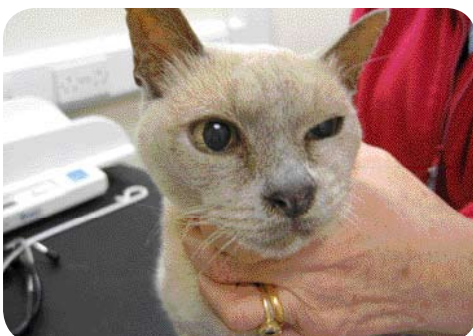
Figure 4: Left sided facial nerve paralysis causing narrowing of the palpebral fissure on the affected side.

The animal should be observed with minimal restraint as it becomes more familiar with the new environment of the consulting room. Signs of poor vision should be noted, such as a reluctance to jump, or bumping into things. Conformation of the head is considered; brachycephalic cats such as Persians have relatively prominent eyes. Facial symmetry and position of the eyes should be assessed, e.g., protruding globe (exophthalmos), deviation of gaze (strabismus), differences in palpebral fissures ( Figure 4 ). Ocular discharges and their nature are noted, e.g., epiphora /mucoïd /purulent etc. Signs of ocular pain are evidenced by blepharospasm, epiphora, photophobia and head shyness.