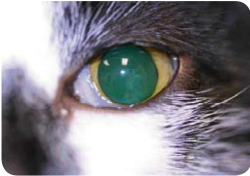
Figure 7: Fibrin in the anterior chamber as a sequel to uveitis.

or any interruptions to the clarity, of the cornea is noted. The anterior chamber may be examined for depth (it is much deeper in the case of posterior lens luxation) and for contents, e.g., blood ( Figure 6 ), fibrin ( Figure 7 ), inflammatory cells, lipid or the lens. The iris size, shape, colour and symmetry are observed.