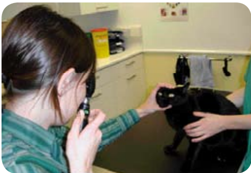
Figure 8: Distant direct ophthalmoscopy.

The dazzle reflex is assessed by shining a bright light into the eye. A partial blink response indicates an intact reflex. As this is a sub-cortical reflex, a cat with cortical blindness may have a positive dazzle reflex. Distant direct ophthalmoscopy is a useful technique ( Figure 8 ). With