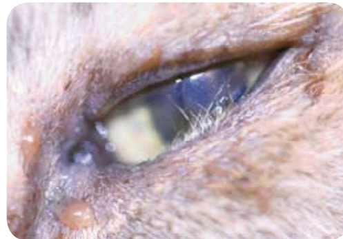
Figure 5: Entropion causing trichiasis.

Colour changes are noted, e.g., white, blue, or red. Eyelid anatomy and their mobility are examined. Testing the menace response involves moving the hand towards the eye in a threatening manner, taking care not to create an air current. This is a learned response, and will be absent in kittens of less than 12 weeks of age. It is a crude assessment of vision, and involves the optic nerve (Cranial Nerve II), the facial nerve (Cranial Nerve VII), and a complicated pathway through the cerebellum. Therefore a cat with cerebellar disease may have normal vision with an absent menace response. The medial and lateral palpebral reflexes are assessed by touching the lateral and medial aspects of the eyelid aperture. These test the integrity of the trigeminal nerve (Cranial Nerve V) and the facial nerve. The oculovestibular reflex, also called the “doll’s head reflex”, is tested by slowly moving the head from left to right and from an upward to a downward position. A normal physiological nystagmus is expected to be present if the oculomotor (Cranial Nerve III), the abducens (Cranial Nerve VI) and vestibular (Cranial Nerve VIII) nerves are intact. The pupillary light response (PLR) is assessed when a focal light is shone into the lateral aspect of the eye. A functioning optic nerve and oculomotor nerve will result in constriction of the pupil of the stimulated eye, along with a consensual or indirect response in the other eye.