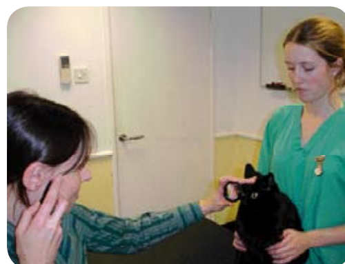
Figure 10: Indirect ophthalmoscopy.

Using the direct ophthalmoscope, set the lens wheel to zero and place it very close to the cat's eye. The clinician's right eye should be used to examine the cat's right eye and their left to examine the cat's left eye. A small area of the fundus may be examined under almost 20 times magnification. It is similar to looking through a keyhole. It can be quite difficult to examine the entire fundus, as the optic disk needs to be examined along with blood vessels, the entire tapetal fundus and the larger non-tapetal fundus. In addition, the examiner is also very close to the cat's teeth! Indirect ophthalmoscopy is an easy method of examining a large area of the fundus, and the author's preferred method. The technique requires some practice. At arm's length distance from the animal, the tapetal reflection is found with a focal light source. A hand-held condensing lens is placed approximately 2cm in front of the eye, and moved slightly until the image is obtained. This image will be upside-down and back-to-front. Magnification depends on the strength of the lens used (a 20 dioptre lens provides almost twice as much magnification). A wide field of view is obtained, which is much easier to interpret. Condensing lenses are inexpensive, and may be obtained from Veterinary Speciality Products for as little as £25 (€35). A head-mounted indirect ophthalmoscope is used at specialist centres, and allows for binocular examination, giving stereopsis.