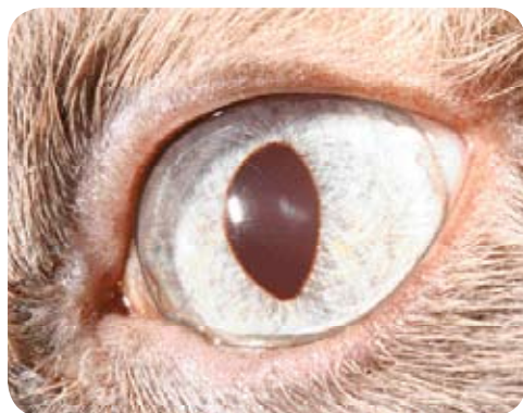
Figure 1: Normal cat's eye; note the visible peripheral iris blood vessels.

The feline eye is unique in many ways including anatomy, vision, and response to disease. There are also a number of ocular conditions that occur only in cats. Many conditions can be diagnosed from clinical appearance alone. Therefore, familiarity with the normal and the abnormal can assist rapid diagnosis and early instigation of the correct treatment. It is always important to examine the affected eye, but not to neglect the eye that seems normal to the owner. A full history and clinical examination is warranted to glean useful diagnostic information for systemic disease with ocular manifestation. This article is intended to focus on the common feline ocular conditions that regularly present at first opinion veterinary practices, and is presented in two parts. Part 1 considers the unique features of the feline eye, and outlines a step-by-step method to perform a thorough ocular examination. Part 2 describes the clinical presentation of common feline ocular conditions that can be easily diagnosed with basic equipment and a knowledge of the normal eye.